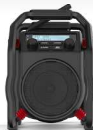
5 UBOX 400R